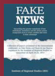
Conference Book (Yearly)