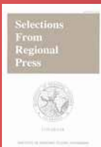
Selections from regional Press (Bi-monthly)