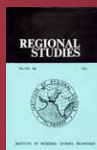
Regional Studies (Quarterly)